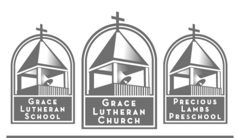
A Family of Ministries For Christian Worship, Education and Care

As a Church As a School As a Preschool As a Mission As a Ministry As a Family of Ministries