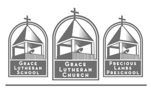
A Family of Ministries For Christian Worship, Education and Care

As a Church As a School As a Preschool As a Mission As a Ministry As a Family of Ministries