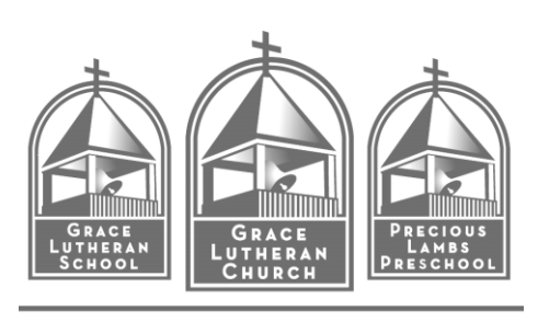
A Family of Ministries For Christian Worship, Education and Care

As a Church As a School As a Preschool As a Mission As a Ministry As a Family of Ministries