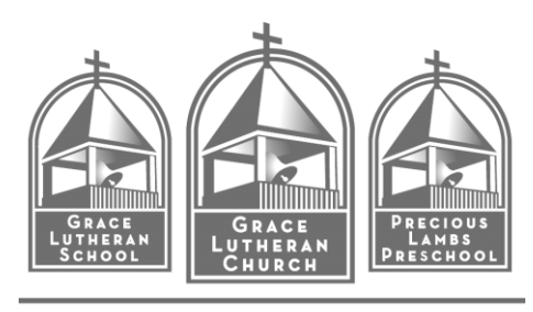
A Family of Ministries For Christian Worship, Education and Care

As a Church As a School As a Preschool As a Mission As a Ministry As a Family of Ministries